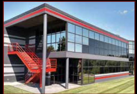
4201 Crums Mill Road, Harrisburg, PA 1,960 SF and 2,726 SF available for lease. Terrific windows. Convenient Colonial Park address.