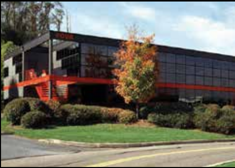
4 Lemoyne Drive, Lemoyne, PA 1,450 SF to 4,094 SF available for lease. Terrific floor to ceiling windows.