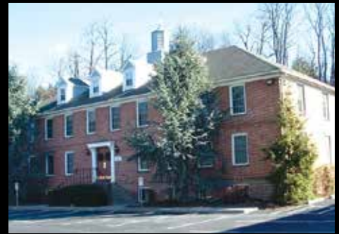
1013 Mumma Road, Wormleysburg PA 900 SF for lease. New suite. Great finishes. Convenient West Shore location.