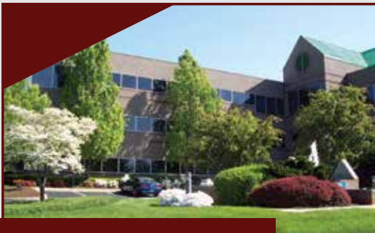
5001 Louise Drive, Mechanicsburg

look for a modest increase in pricing as buyers simply have fewer choices.