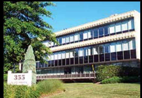
355 North 21st Street, Camp Hill, PA 600 to 2,700 SF available. New suites. Large windows. Covered parking. Great rates.