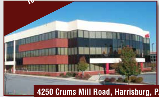
4250 Crums Mill Road, Harrisburg, PA

It was another strong Quarter for the East Shore Business District. Absorption totaled a solid 42,842 sq. ft., fueled by stronger demand across all segments of the Marketplace.