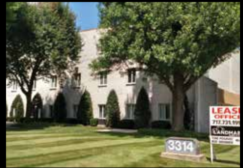
3314 Market Street, Camp Hill, PA 1,517 SF for immediate occupancy. Thousands in recent renovations..