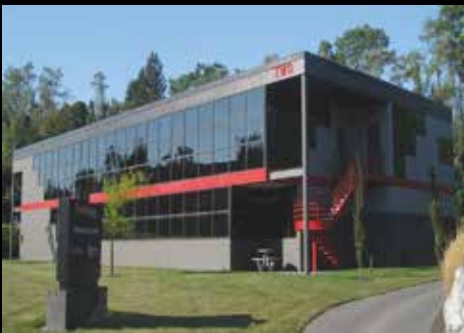
2 Lemoyne Drive, Lemoyne, PA 4,500 SF for lease. Terrific West Shore location. Great floorplan. Gorgeous windows.