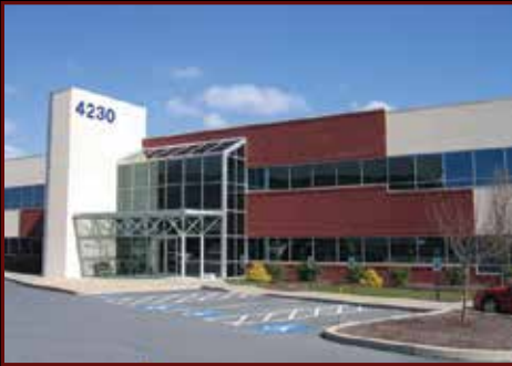
4230 Crums Mill Road, Harrisburg, PA 1,800 to 4,831 SF available for lease. Excellent views. Terrific Colonial Park location.