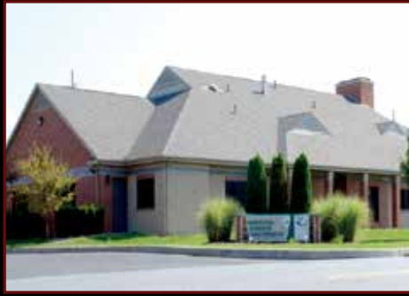
2704 Commerce Drive, Harrisburg, PA 1,000 to 10,000 SF available. High end finishes throughout. Ample on site parking.