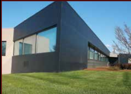
2578 Interstate Drive, Harrisburg, PA 13,800 SF building for sale or lease. Modern first class property.