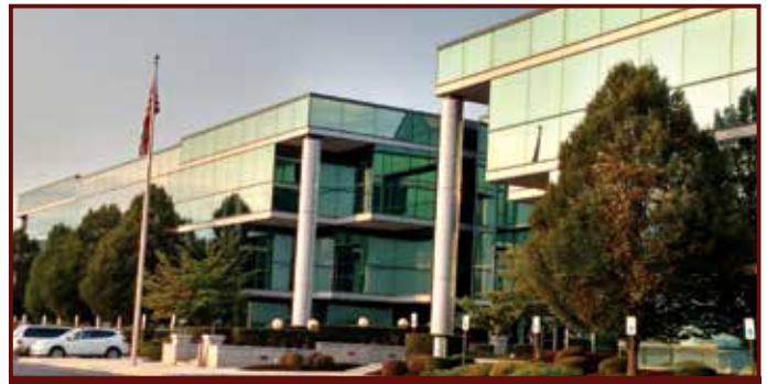
2400 Thea Drive, Harrisburg, PA

Up to 133,000 SF available. Large flexible floorplates. Terrific window lines. Convenient on-site parking.