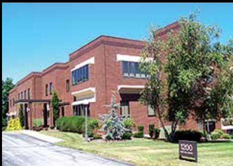
1200 Camp Hill Bypass, Camp Hil, PA 1,157 to 18,879 SF for lease. Spectacular address. Easy access.