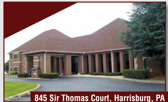
845 Sir Thomas Court, Harrisburg, PA

Class B occupancy rates remained at 92% as absorption totaled 5,000 sq. ft. We expect modest improvement in this segment, the degree will hinge on just how well the B+ inventory can be eradicated over the next several months. If demand continues and a pullback is averted the Class B segment could see better than anticipated gains going into 2018.