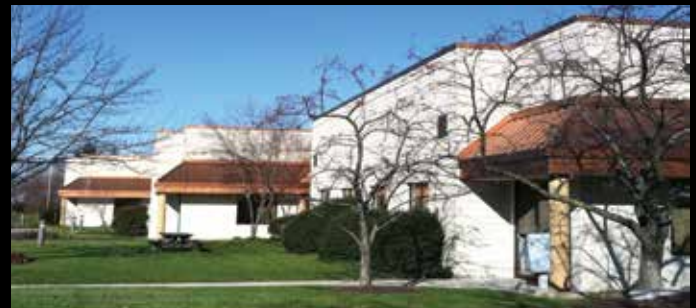
5070/5072 Ritter Road, Mechanicsburg, PA 2,750 SF to 28,347 SF available for lease. Thousands in renovations to begin shortly.