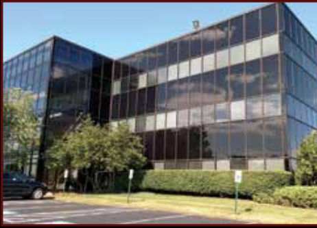
3605 Vartan Way, Harrisburg, PA Suites from 900 to 4,500 SF and up. Terrific windows. Great location. 6 per 1,000 SF parking.