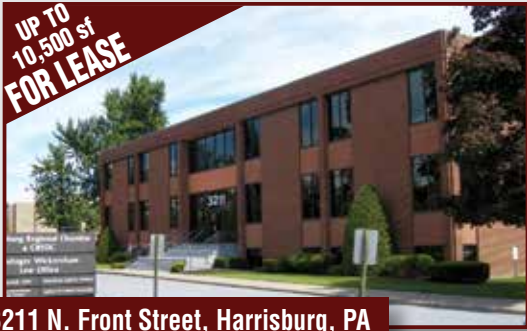
3211 N. Front Street, Harrisburg, PA

2016 was an excellent year for the Downtown Business District as unprecedented demand pushed absorption to its best gains in years. Over