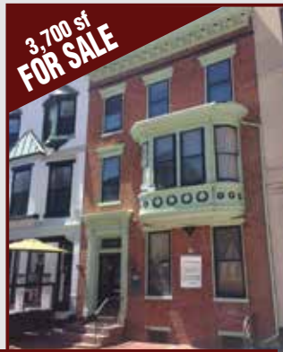
234 State St, Harrisburg, PA

The Class B segment remained unchanged at 93% in the First Quarter of 2017. Absorption totaled negative 4,189 sq. ft. We are very encouraged with the recent repositioning of several Front Street properties which could total over 25,000 sq. ft. of absorption in the months ahead. We view this as an important needed event to further stabilize the Downtown Business District into 2018. We look for more activity in this segment going further and expect this trend of repositioning to continue.