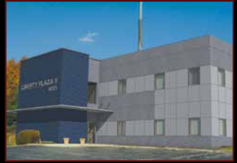
600/800 Corporate Circle, Harrisburg, PA 1,700 to 3,533 SF for lease. Recently renovated. Terrific finishes. Easy access.