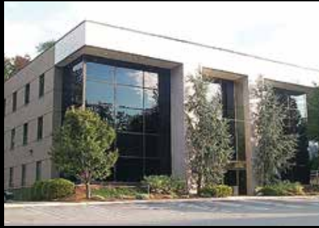
1017 Mumma Road, Wormleysburg, PA 800 SF available. First class facility. Excellent layouts. Available immediately.