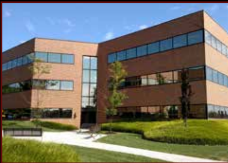
2000/2040 Linglestown Road, Harrisburg, PA 1,500 to 2,800 SF available for lease. Great windows and layouts.