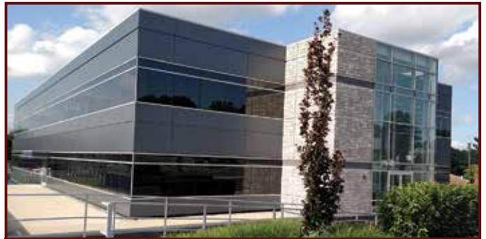
75 South Houcks Road, Harrisburg, PA

Up to 133,000 SF available. Large flexible floorplates. Terrific window lines. Convenient on-site parking.