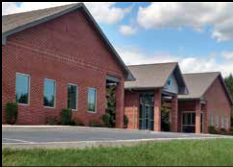
4 Flowers Drive, Mechanicsburg, PA 1,300 SF available at this West Shore address. Owner will divide.