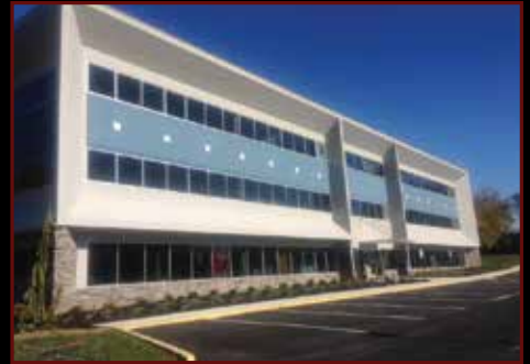
4800 Linglestown Road, Harrisburg, PA New suites up to 4,900 SF. Available immediately. Excellent signage.