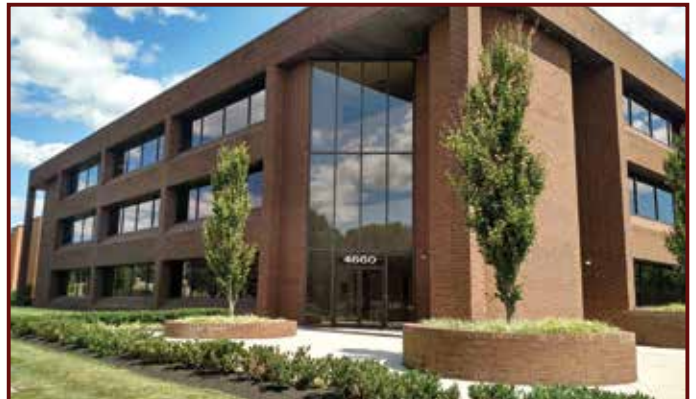
4660 Trindle Road, Camp Hill, PA

1,500 to 7,201 SF for lease. Great location in Lower Paxton Township. Close to all amenities. Easy access to all interstates. Ample parking.