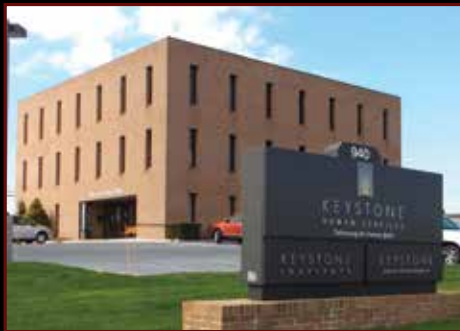
940 East Park Drive, Harrisburg, PA 1,500 to 8,500 SF available for lease. Located just off I-83. Signage available.