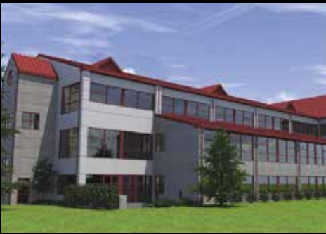
1215 Manor Drive, Mechanicsburg, PA One 1,464 SF suite remaining. Owner will Build to Suit. Great windows.