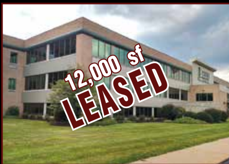
449 Eisenhower Boulevard, Harrisburg, PA Up to 10,600 SF for lease. Great signage. Easy access. Close to all Interstates.