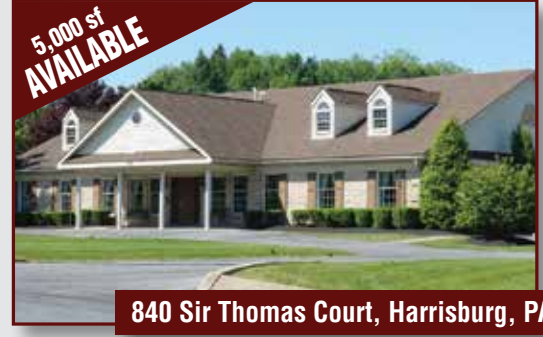
840 Sir Thomas Court, Harrisburg, PA

The East Shore Business District produced solid gains in the First Quarter of 2016. Absorption totaled 56,260 sq. ft. topping all of 2015 figures as demand surged from all segments on the East Shore.