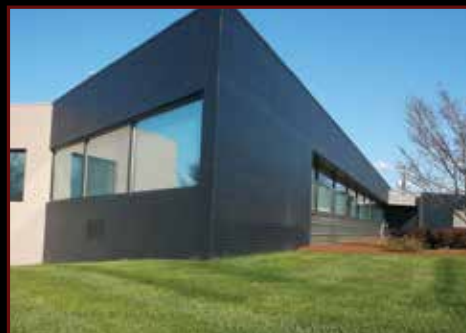
2578 Interstate Drive, Harrisburg, PA Sale or lease. 13,800 SF building for sale. 1,900 SF for lease. Modern first class property.