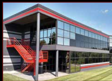
4201 Crums Mill Road, Harrisburg, PA 1,960 SF available for lease. Terrific windows. Convenient Colonial Park address.