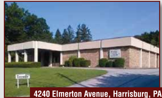
4240 Elmerton Avenue, Harrisburg, PA 8,000 sf commercial building for sale in the heart of Colonial Park.

Occupancy rates for the Class B segment closed the First Quarter at 92%. Absorption totaled 18,150 sq. ft. as demand from a number of acquisition related transactions outpaced supply. Faced with pressure from assets in or just out of receivership we view the pace of the First Quarter results as encouraging and are pleased with market fundamentals as we move toward the second half of 2016.