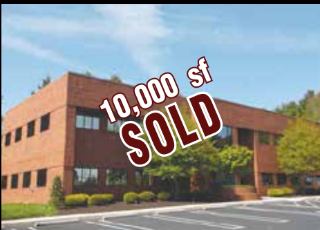
4661 Trindle Road, Camp Hill, PA 1,500 SF for lease. Great location in Camp Hill. Flexible floorplan. Ample parking.