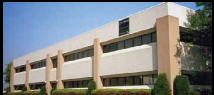
3 Crossgates Drive, Mechanicsburg, PA Up to 20,000 SF available. Convenient West Shore location. Priced to lease.