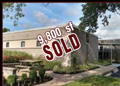
4601 Devonshire Road, Harrisburg, PA 1,500 to 7,200 SF available. Medical and Non Medical Suites for lease. Available immediately.