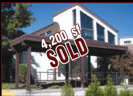
895 S. Arlington Avenue, Harrisburg, PA 4,200 sf medical building for sale. Adjacent to Osteopathic Hospital.