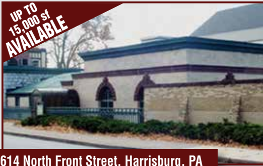
614 North Front Street, Harrisburg, PA

Absorption increased at impressive levels in the First Quarter of 2016 totaling 12,934 sq. ft. Occupancy rates remained unchanged at 90%. We expect these properties should improve modestly with the gradual firming of rental rates and moderate demand for growth over the next several quarters. We see the possibility of a severe pullback as remote and anticipate further improvement going forward.