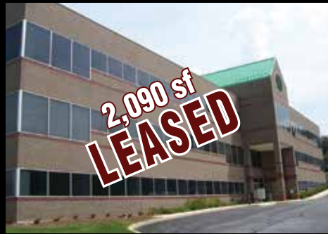
5001 Louise Drive, Mechanicsburg, PA 1,800 SF for lease. Class A finishes. Last suite available. New Lobby. Easy access.