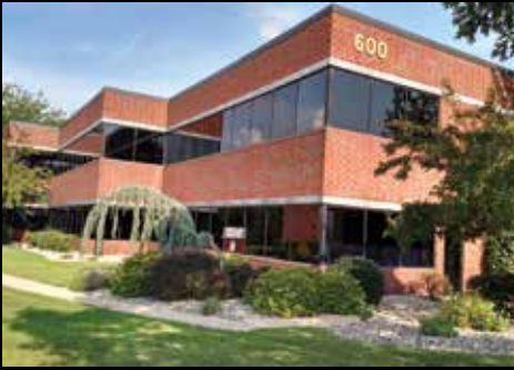
600 N. 12th Street, Lemoyne, PA 1,797 SF for lease. First class finishes. Ample on-site parking. Available immediately.