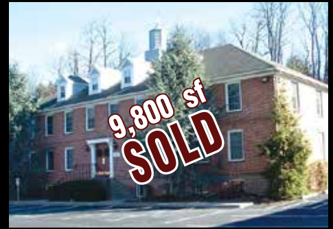
1013 Mumma Road, Wormleysburg, PA 900 SF for lease. New suite. Great finishes.