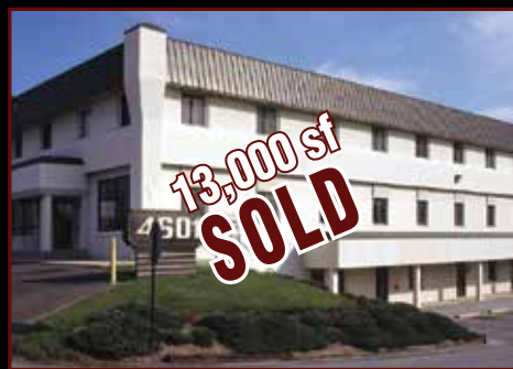
4601 Locust Lane, Harrisburg, PA 800 to 1,900 sf available for lease. Great small suites. Heart of Colonial Park.