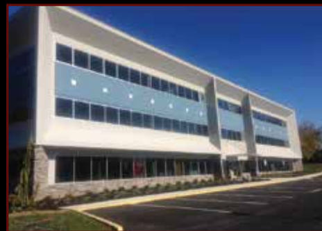
4800 Linglestown Road, Harrisburg, PA New suites from 500 SF up to 6,000 SF. Available immediately. Excellent signage.