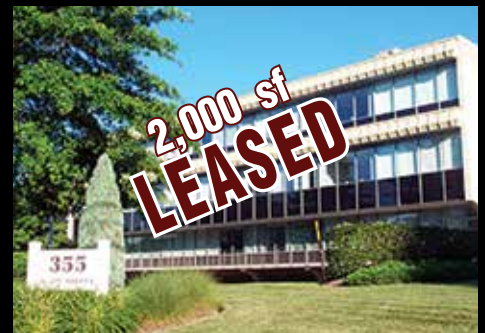
355 North 21st Street, Camp Hill, PA 600 to 3,100 SF available. New suites. Large windows. Covered parking. Great rates.