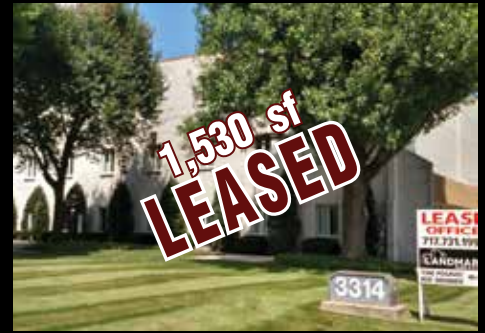
3314 Market Street, Camp Hill, PA Suites from 900 SF to 4,500 SF for immediate occupancy. Thousands in recent renovations.