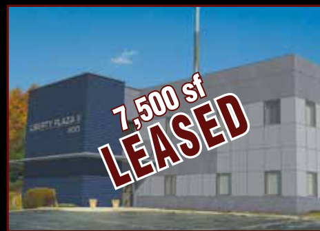
800 Corporate Circle, Harrisburg, PA 1,700 SF and up for lease. Recently renovated. Terrific finishes. Easy access.