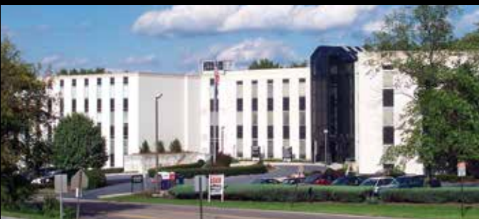
20 Erford Road, Lemoyne, PA Small suites now available for lease. Covered parking. Close to all areas. Ideal for any small user. On-site parking garage.