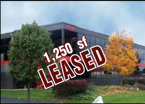
4 Lemoyne Drive, Lemoyne, PA Small Class A suite for immediate occupancy. Fantastic windows and layout. Ideal for small user.