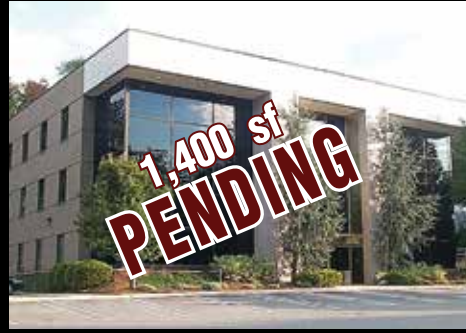
1017 Mumma Road, Wormleysburg, PA 800 to 1,400 SF available. First class facility. Excellent layouts. Available immediately.