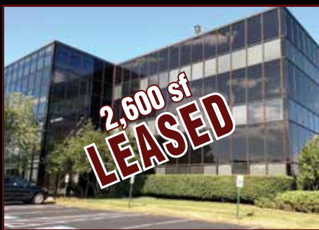
3605 Vartan Way, Harrisburg, PA Suites from 900 to 4,500 SF and up. Terrific windows. Great location. 6 per 1,000 SF parking.